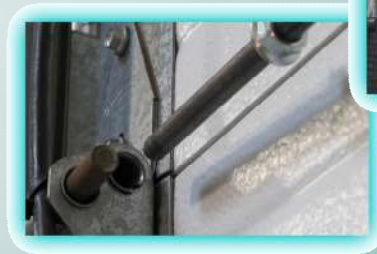
Easy to install steel rods