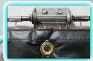
Stainless steel collar hooks and durable brass grommets