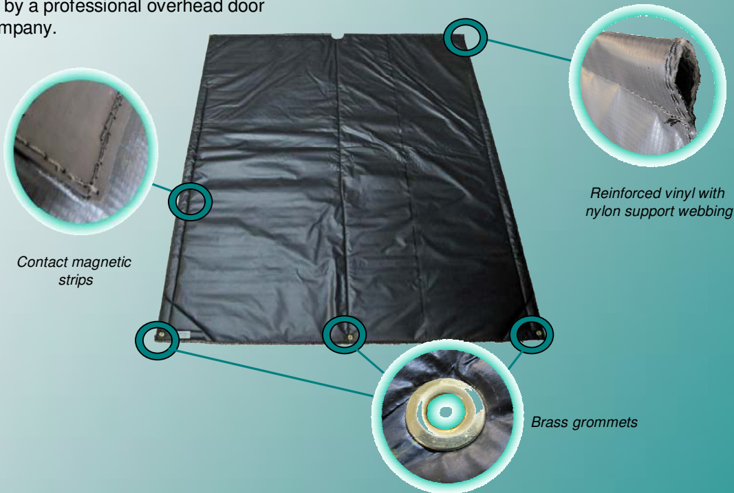
Contact magnetic strips