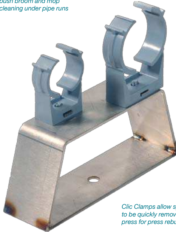
Stainless Steel Floor Mount Brackets

Designed to enable both push broom and mop cleaning under pipe runs