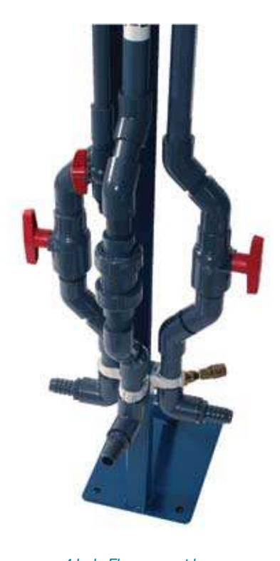
4 hole Floor mount base

Clean professional equipment installation