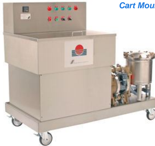
Cart Mounted Tank